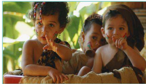
More for Kids and Teens