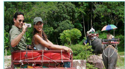
More to Discover