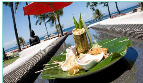
More Refined Cuisine