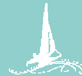
Sports & Leisure