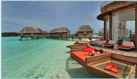
More Locations & Space