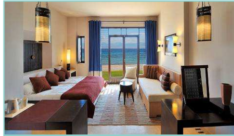
More Design & Comfort